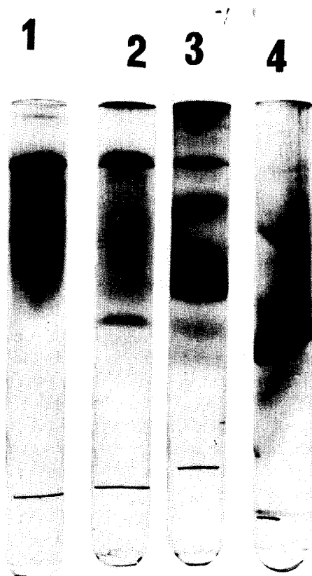
Fig.2. Polyacrylamide gel electrophoresis in non-dissociating conditions. gel 1: native PRS. gel 2: mixture of the isolated \alpha and \beta subunits submitted to the renaturation process. gel 3: isolated \alpha subunit after renaturation. gel 4: isolated \beta subunit after renaturation.

protein (around 100 \mu g). Some very faint bands, corresponding to degradation compounds are seen. It must be noticed that a heavier degradation takes place on the \beta subunit than on \alpha subunit. This degradation might be due to some contamination of PRS by proteases, which would partly split the enzyme during the incubation with the organomercurial-Sepharose at 37°C. Fasiolo et al. [8] already observed a higher sensitivity of \beta subunit to proteolytic cleavage